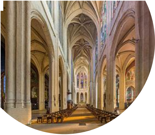
Organist in the Church of Saint-Gervais-Saint in Paris