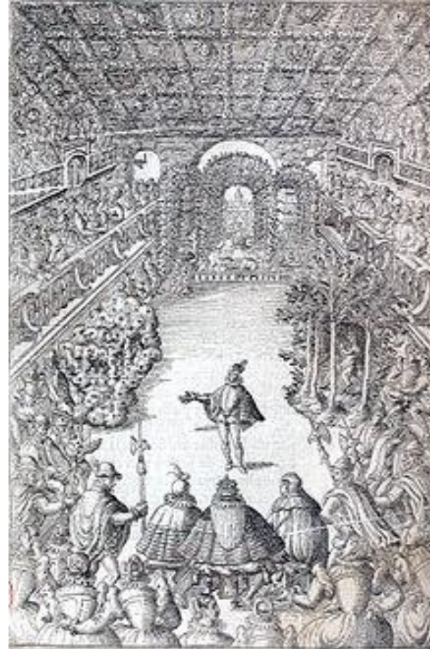
Salle du Petit-Bourbon] ベルサイユ劇場

J.B Lully Ballet de la Nuit 1653 (Ouverture) https://www.youtube.com/watch?v=PdeqbpfxaK8