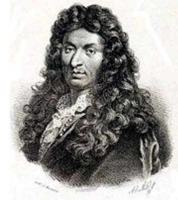
Jean-Baptiste Lully, around 1670