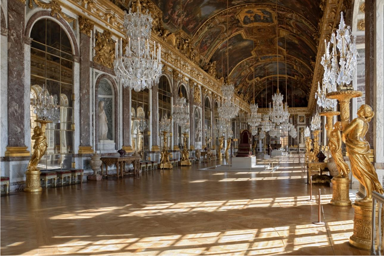
Palace of Versailles