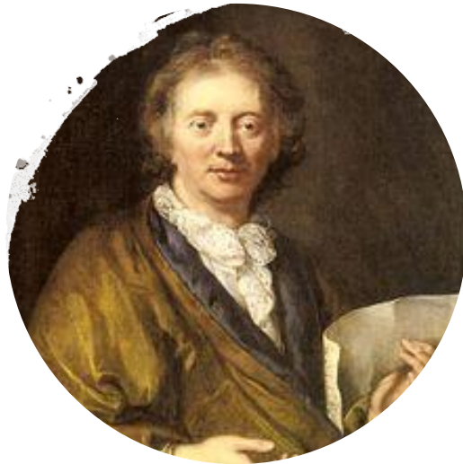
Les Concerts Royaux. François Couperin https://www.youtube.com/watch?v=gAh8b2jW3hU