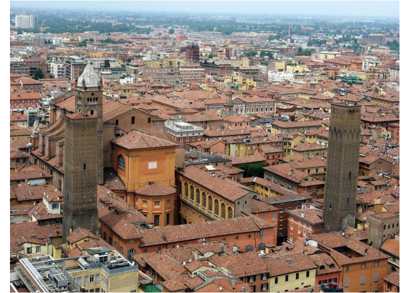
Studied in Bologna

Arcangelo Corelli Sonate da Chiesa Op.3, https://www.youtube.com/watch?v=MkKiQf13S9s