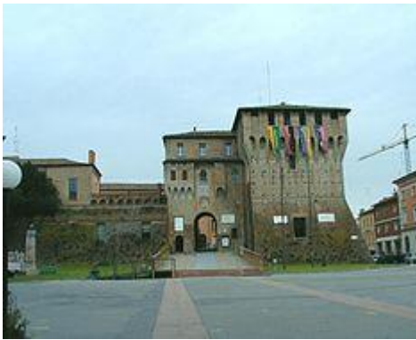
Born in Emilia-Romagna Fusignano

an Italian violinist and composer of the Baroque era. Key person in the development of the modern genres of sonata and concerto, the preeminence of the violin, the pioneer of modern tonality and functional harmony.